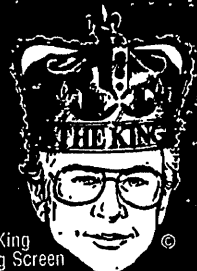
Paul The King of Big Screen