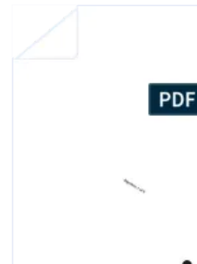
Simon Esterton Final