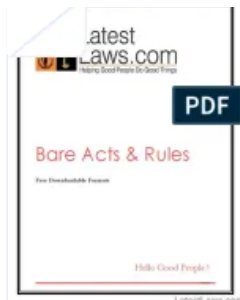
West Bengal Co-Operative Societi...