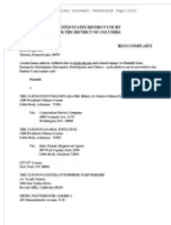
Clinton Soros RICO