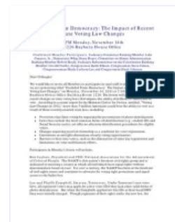
Democrats Concerns With...