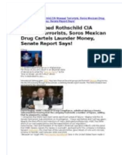
Global Corruption & George Soros