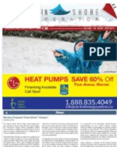
April 2017 ESC