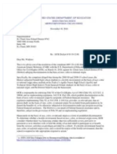
CAIR Files Complaint Again...