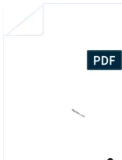
Simon Esterton Final