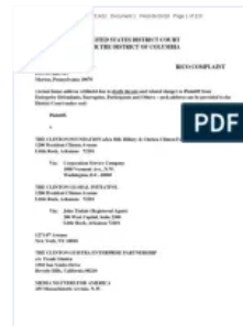
Clinton Soros RICO