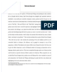
Tanti at the Oval