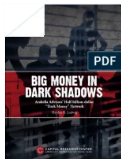
Arabella Big Money in Dark Shadows